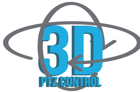
3 PTZ Controls Easy click zoom, efficient drag and control