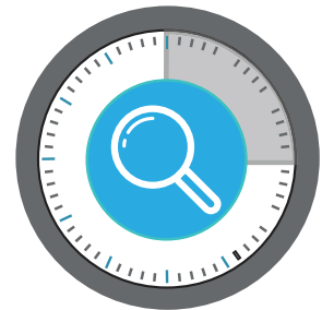
Time Slice Event Search Intelligent Event Snapshot Search functionality