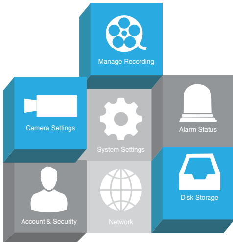
Easy to use Modular Design that is both Expandable and Reliable

SiBell Recorders were designed with advanced SOC Technology, sleek user interface software and embedded to create a system that is both secure and user-friendly. This series of embedded recorders are powerful, easy to use and provide superior image quality and system stability. Designed specifically for the Network Video monitoring field, Sibell's Video Recorders are high performance, high quality with smart Camera Management capabilities as well as advanced record search.