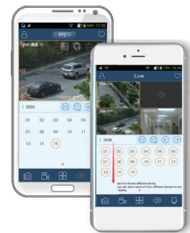
Tablet and Smart Phone Applications