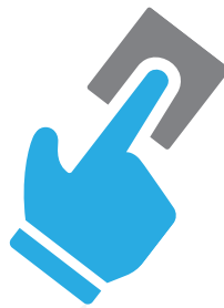
Functionality at your finger-tips; Instant click control panel